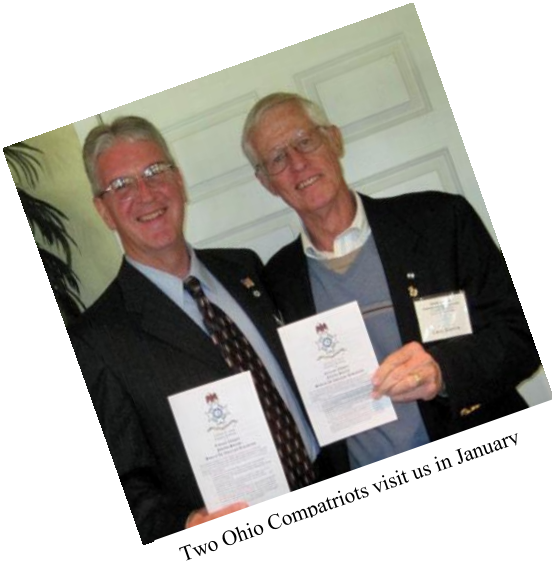
Two Ohio Compatriots visit us in January